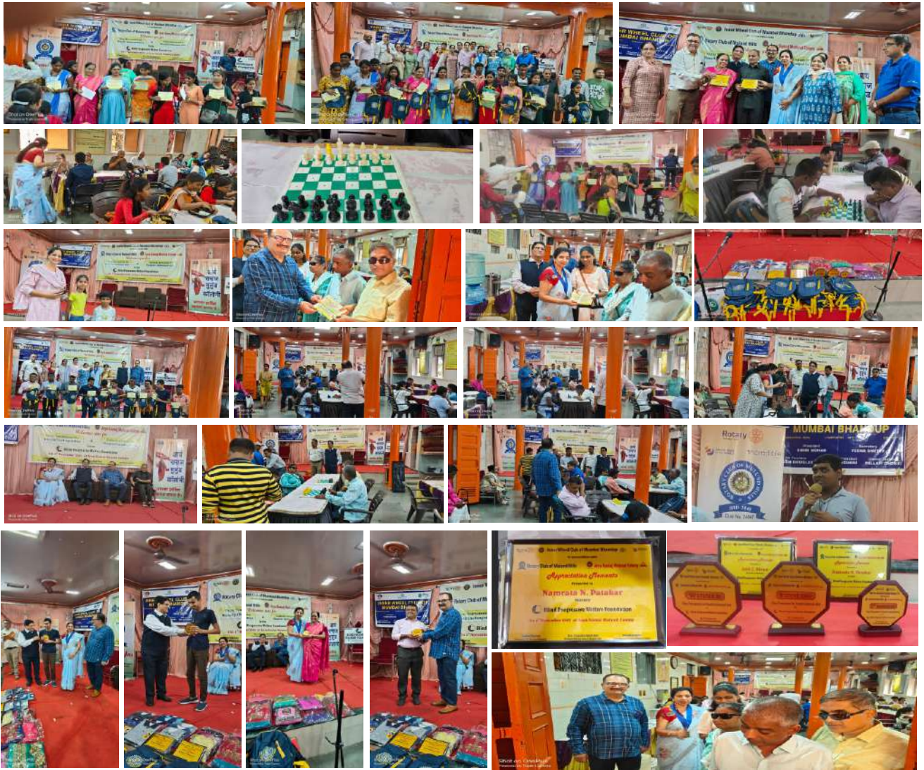
Chess Competition for visually challenged boys and Cultural Programme by visually challenged girls at Arya Samaj, Mulund Colony on 5th November 2023