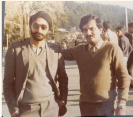
Find the difference in 35 yrs