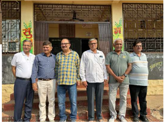
Visit to D K Suryarao Vidyalaya, Padha to evaluate their requirements and supervising RCC on 21st November 2023