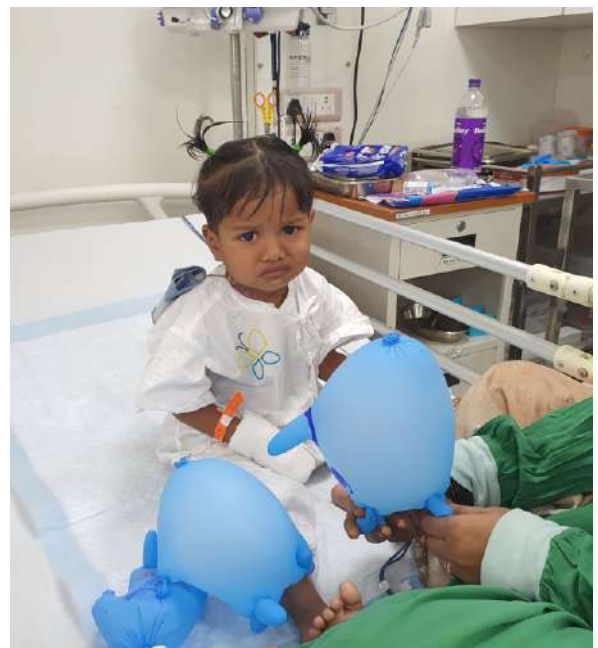
Paediatric Heart Surgeries on 21 & 22 November 2023 at Jupiter Hospital ,Thane