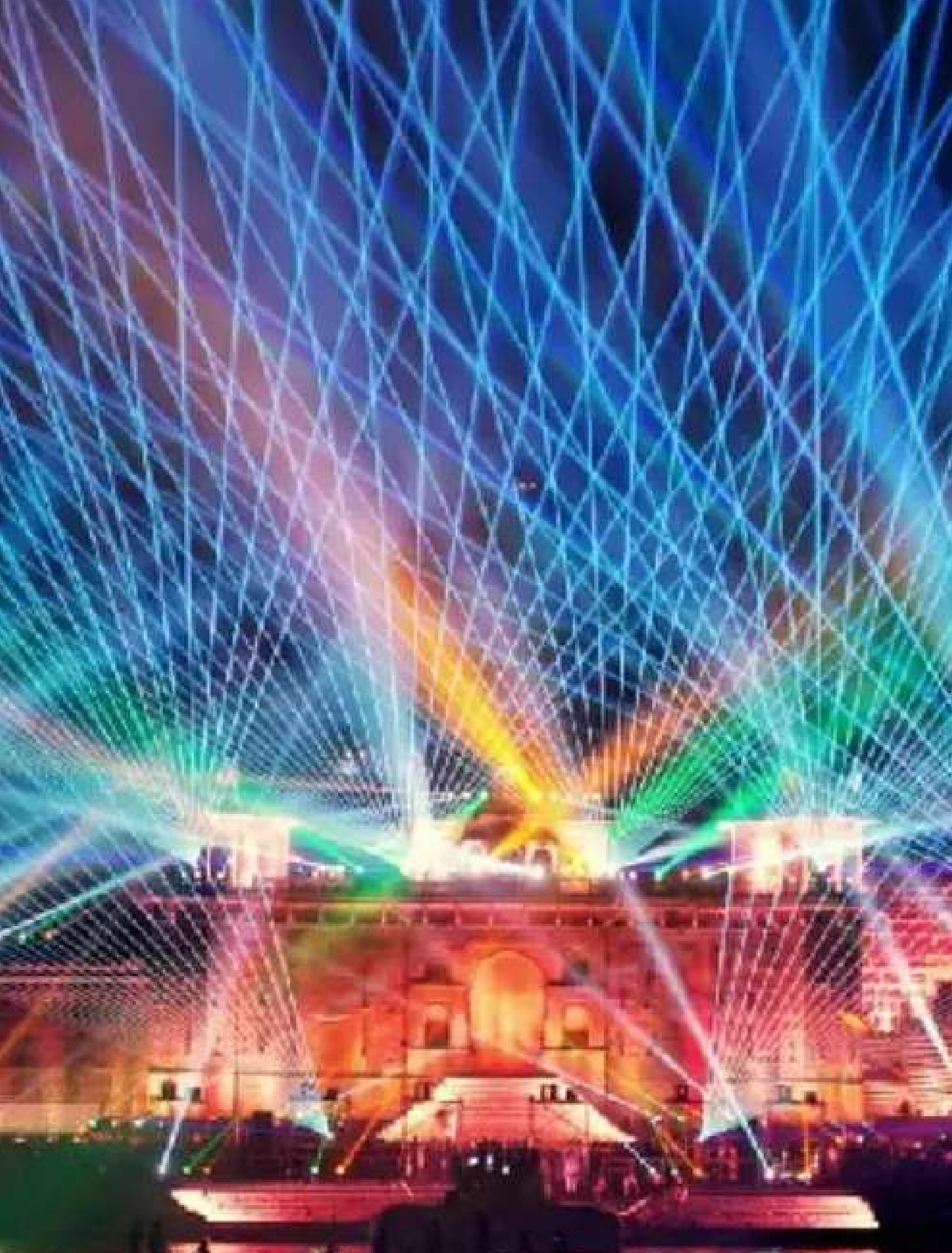
LASER SHOW AT VARANASI ON DEV DEEPAWALI