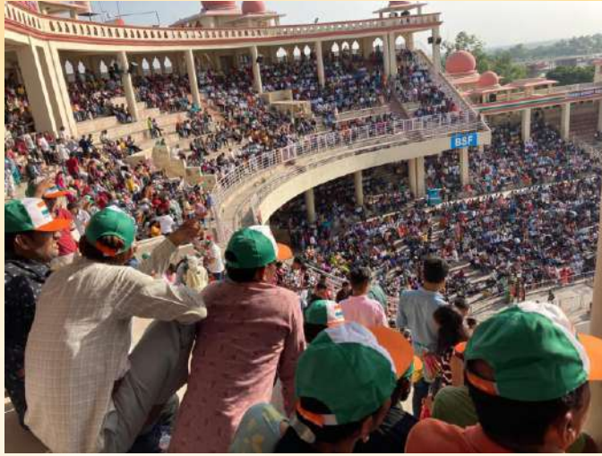
Wadagbalkars at India Pakistan Border Parade, Attari